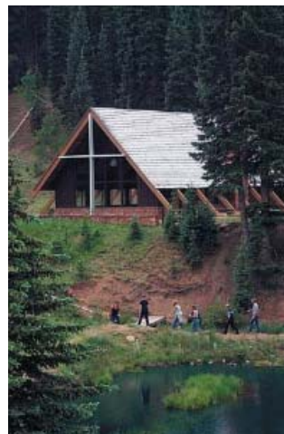
The chapel was built in 1959

Ministry Benefit: The Chapel has served as the spiritual gathering place for the Rocky Mountain ministry. After almost 50 years of service, the improvements are intended to allow us to enjoy and utilize this special place through the year.