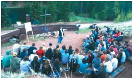
Sr. High Campers worshipping at the Gold Mine