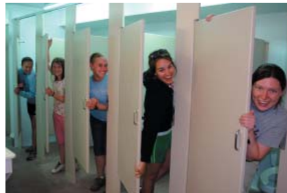
Female staff members admiring the improved facilities of the Eiger Bathhouse