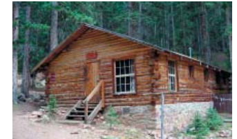
Pleiades serves as a year-round facility for summer staff and guests

Renovate/replace Quonset (Rustic) Cabins